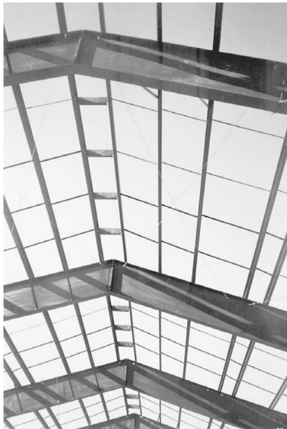
FIGURE 5.30 Diagonal purlin bracing. Note sturdy ridge channels.